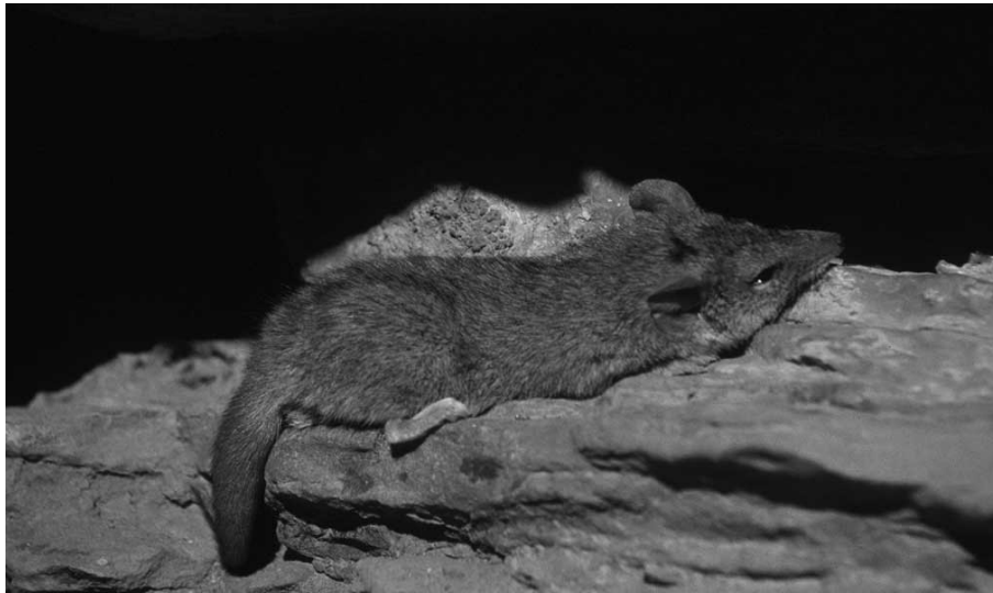
Fig. 2. A basking Pseudantechinus macdonnellensis .

(Geiser and Drury 2003). So a combination of low TMR, access to solar energy during passive rewarming from daily torpor, and access to solar energy during the normothermic rest phase allows a mammal like S. macroura to reduce daily energy expenditure by up to 50%. Thus, while the desert environment may be limiting with respect to food availability, the high T_a fluctuations and access to solar radiation provides another potential source of energy that is not commonly available to heterothermic species in cold climates with long and dark winters.