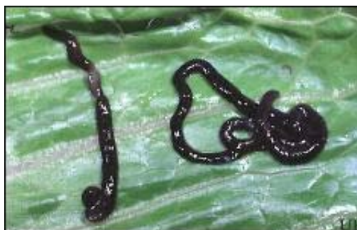
Figure 1. A land planarian, Bipalium kewense Moseley.